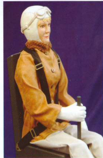
1/3 scale female pilot – this one made to represent Hanna Reitsch