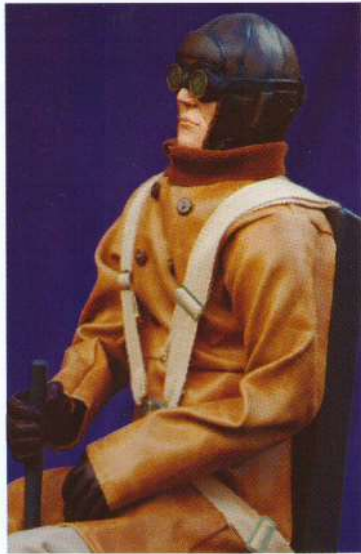
1/3 scale WW1 pilot