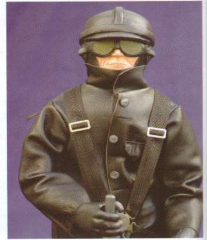
The finished item, this one WW1 German Pilot.