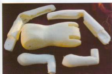
A set of body parts. Two different foams are used to create this set.