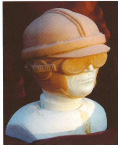
A completed master used to make the mould

Each item is individually cast from the moulds. We use a selection of modern lightweight, resilient materials for our pilots, each one chosen for the specific item and use. For example, we use rigid moulding materials for the heads, hands and feet but use an additive to reduce the density to keep overall weight down. The detail that can be reproduced using modern moulding and casting techniques is amazing and the rubber moulds we use can even reproduce unwanted fingerprints on the original item!