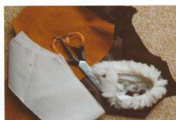
Leather, fabric and lambs wool are some of the raw materials used to dress the pilots.