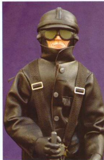
Scale WW1 German pilot