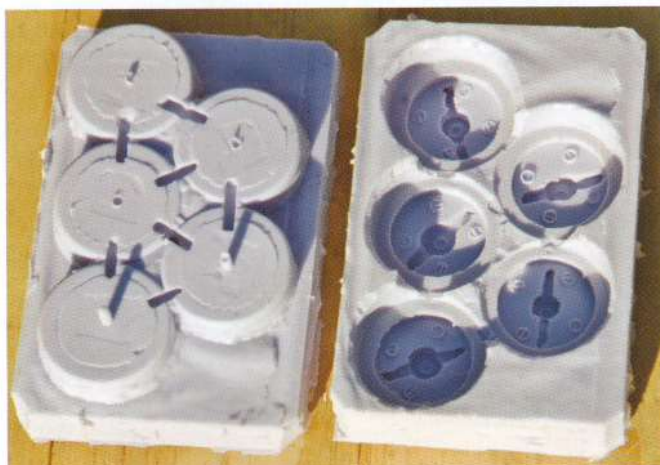
This simple 2-piece mould is for the clasps of QS style harnesses