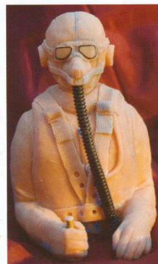
Left: Another master – this one at 1/6 scale.