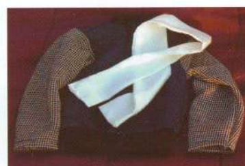
A 1/3 scale fabric jacket and silk scarf.