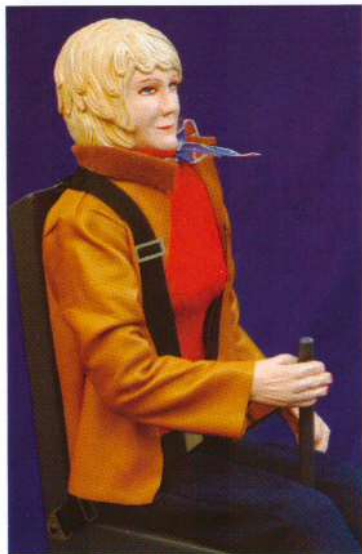
1/3 scale civilian female pilot