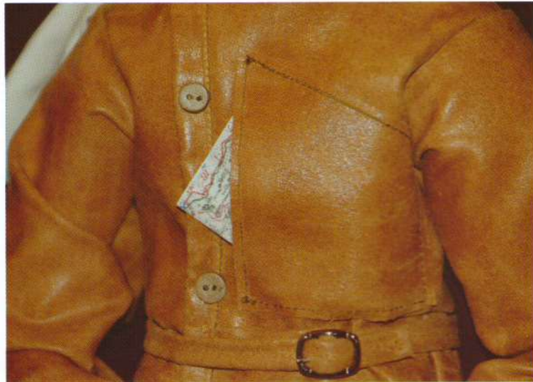
Scale details include scale WW1 trench maps.